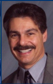
Doctor Ray Guarendi